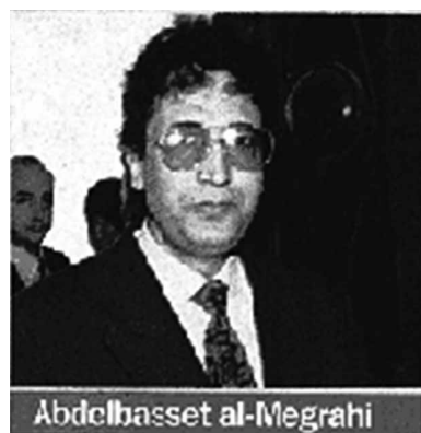
Figure 5. Magazine photo of Al-Megrahi.

in some unusual behaviour for several minutes, and attempted to identify that “customer” 1 day later. Most of the clerks performed so poorly on the identification test that the researchers shortened the delay to 2 hours.