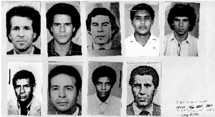
Figure 2. Photos shown to Gauci.