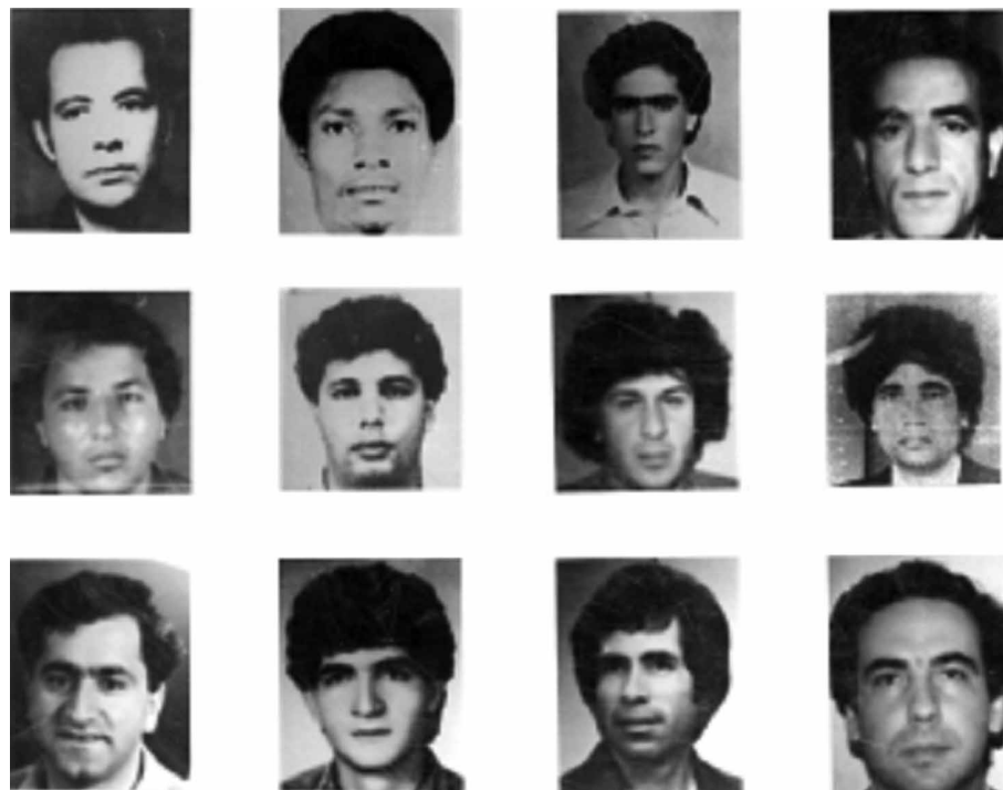
Figure 4. Photo array containing Al-Megrahi's passport photograph.